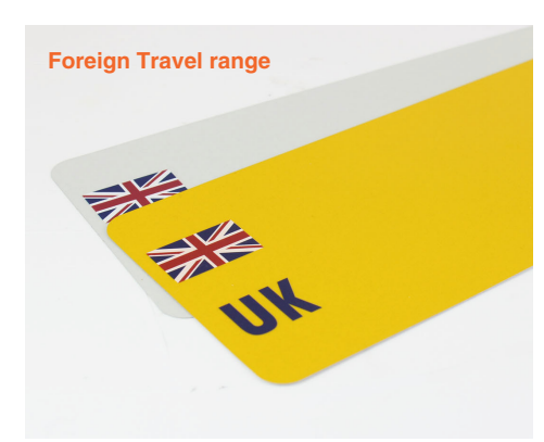
*Images shown represent a selection of our legal side badge options only

With all the recent changes in number plate legislation - BSAU 145e, GB Euro badges being outlawed and the introduction of green badges for zero emission vehicles to name but three - we understand if you're confused about what you're permitted (or able) to print and display on UK road legal plates.