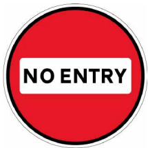
No Entry 300mm diameter