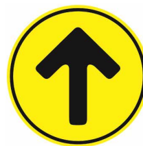
Arrow 300mm diameter