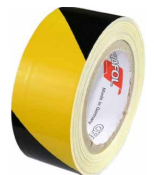
5091 anti-slip floor tape 25mtrs x 50mm wide