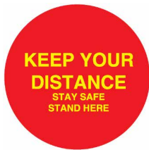
Keep Your Distance 300mm diameter