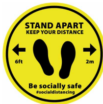
Stand Apart 300mm diameter