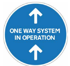
One Way 300mm diameter