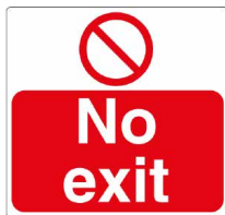
No Exit 300mm x 300mm