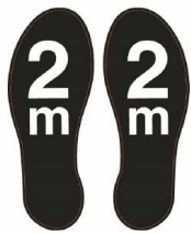
Footprint outline 300mm long